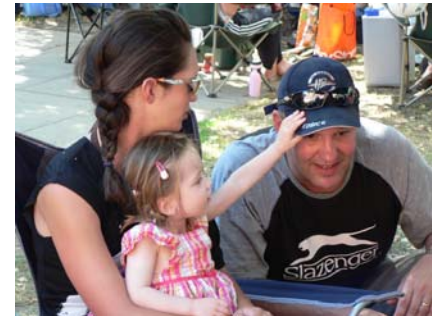
OMG this guy never stops talking, that's it I'm going to nick his hat!!