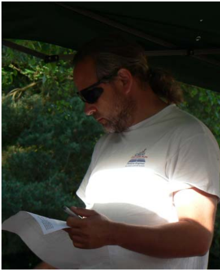
Captain Ahab or ageing rock star?