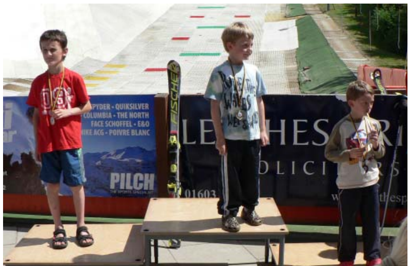
Sometimes, just getting them to look at the camera is the hardest part.