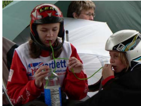
Sweets & Lemonade the perfect combination?