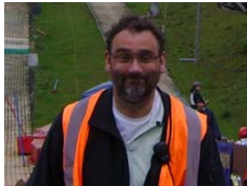
Before he broke the timing gear!