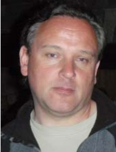
Race Manager for a day VERY LONG DAY.....