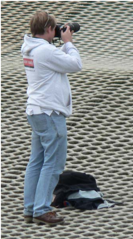
Before the rain!