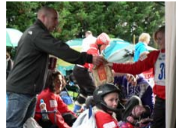
High energy food