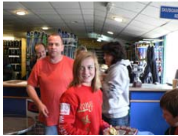
That's my girl