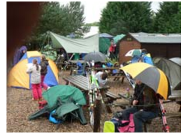
Rain has set in