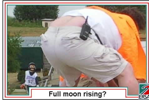
Full moon rising?