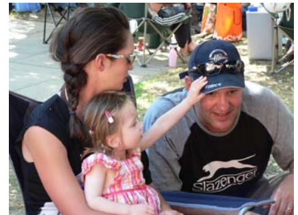
OMG this guy never stops talking, that's it I'm going to nick his hat!!